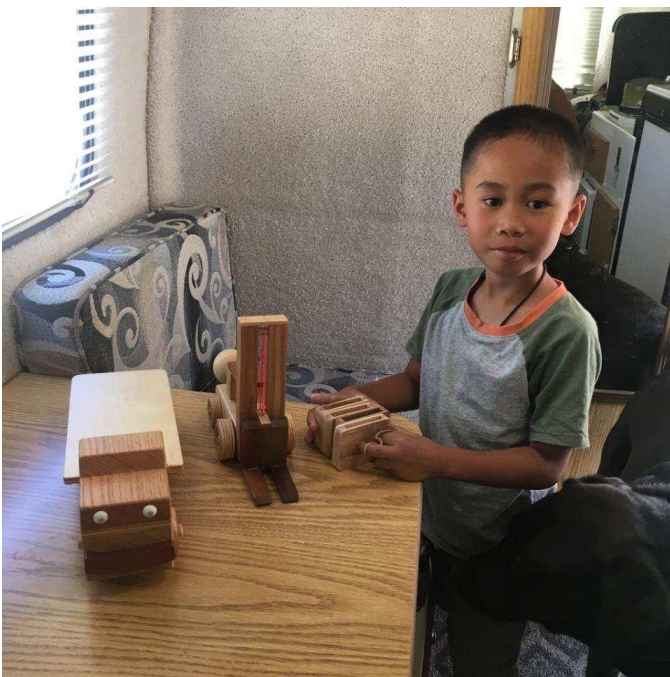
Happy child at High Tech Elementry School

Jeff Bratt was very helpful when we made the table for Station 27. He made the cribbage board they still use. He helped out with at least 37 other things as the project went along.