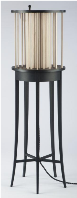
11 Reuben Foat