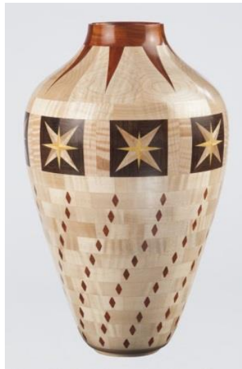
14 Ed Zbik