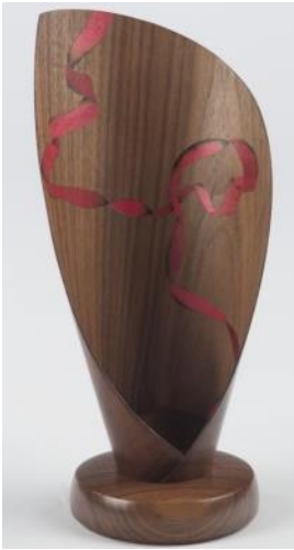
10 Paul Schurch