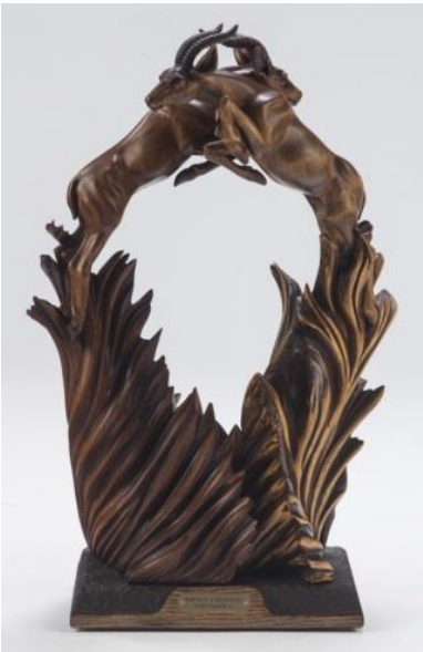
2 Bill Churchill