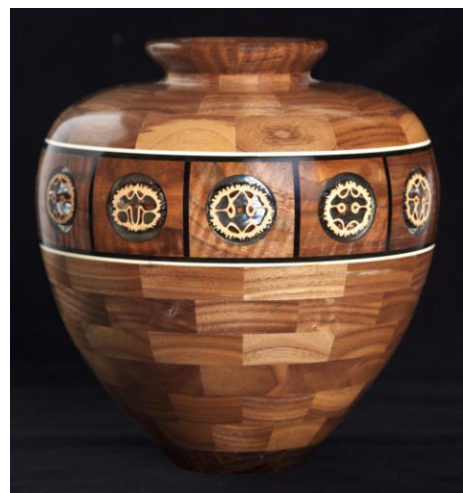
Walnut - Segmented Vessel Douglas Buddenhagen