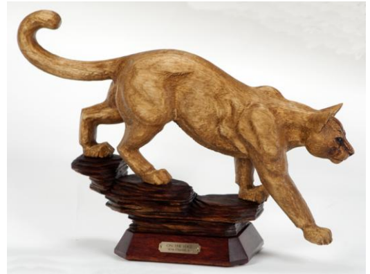
On The Edge - Mountain Lion Bill Churchill