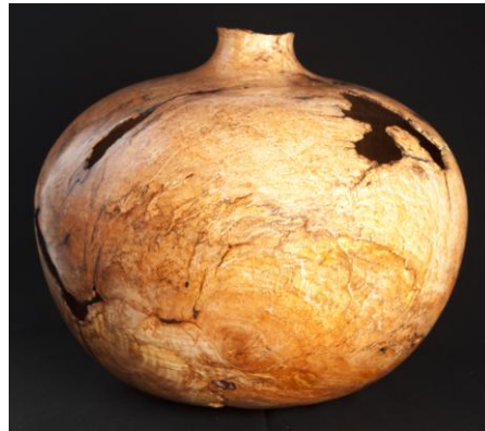
6 Pounder Pete Campbell