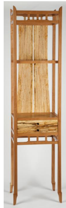
Display Stand Brian Carnett