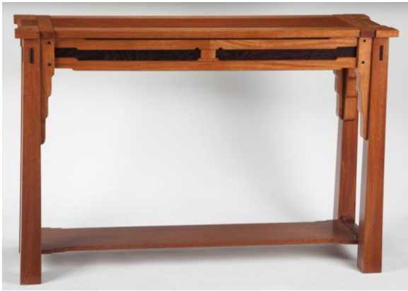
Hall Table Louis J. Plante