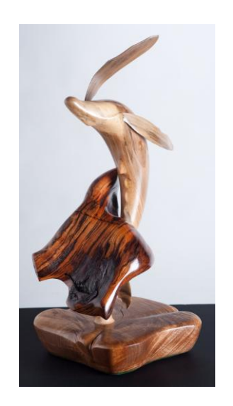
<u>Virgil Krueger</u> "<u>YAAAH" Breaching Whale</u>