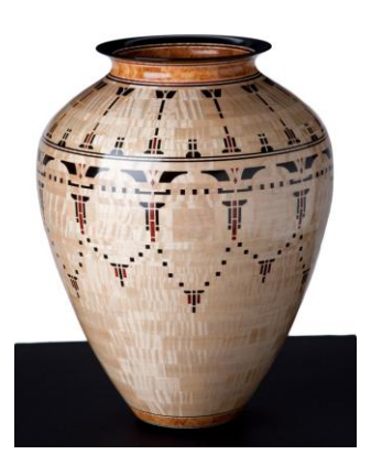
Ken Cowell "Vessel-#901"