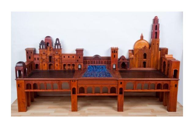
<u>Del Cover</u> "<u>Balboa Park Bench</u>"