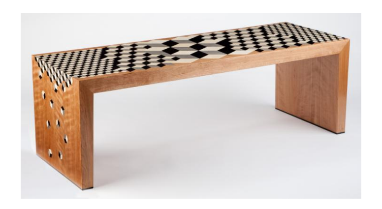
<u>Viki Hennon</u> "<u>Louis Falls Coffee Table</u>"