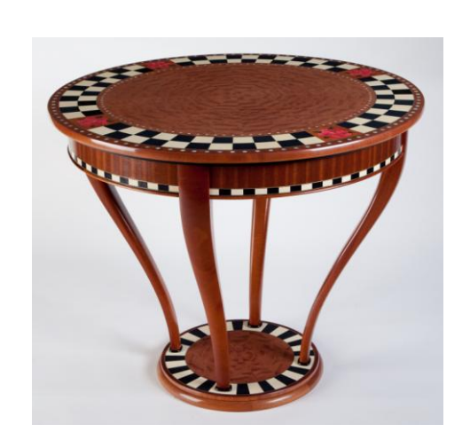
Tom Christenson "Display Table"