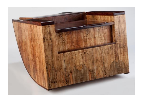
Sue Spray "The Cube Rocker"