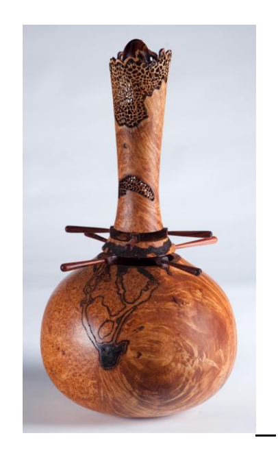
Pete Campbell "Smooth"