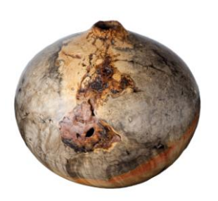
Mike Jackofsky "Natural Edge Hollow Form"