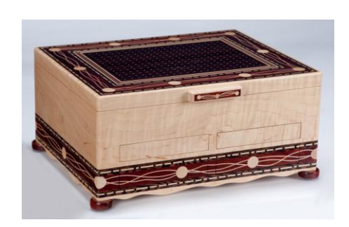
<u>Tom Thorton</u> "<u>4 Drawer Jewelry Box</u>"