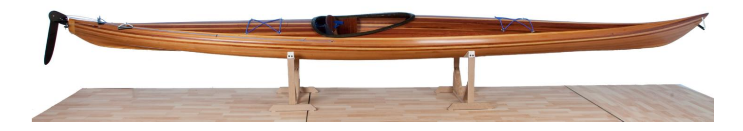
<u>Peter Shoemaker</u> "<u>High Performance Touring & Cruising Kayak</u>"