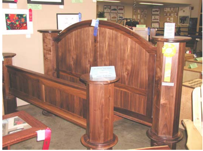
Christian Seymour King Bed San Marcos High School