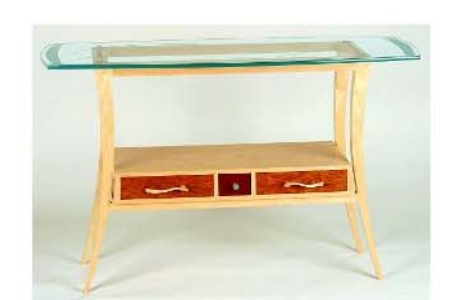
"Emily" a table to display collectables John DeGirolamo