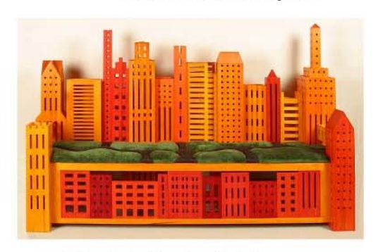
City Park Bench - Del Cover