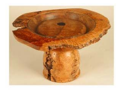
Pete Campbell's Tables and Lidded Jar