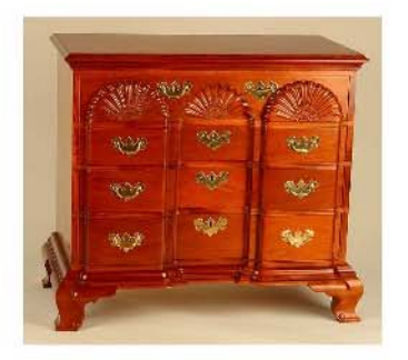
Three Shell Bureau - Bill Cox