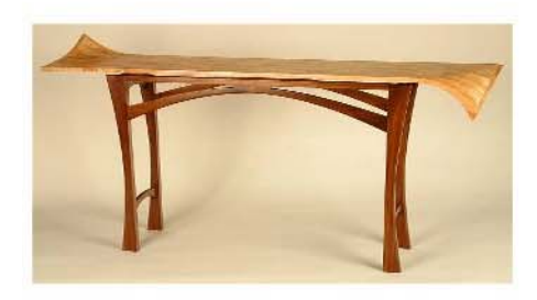
Whimsical Hall Table - Jesse Cook