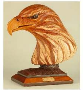
Bill Churchill's "Freedoms symbol" eagel bust and "Meditation" Native American bust