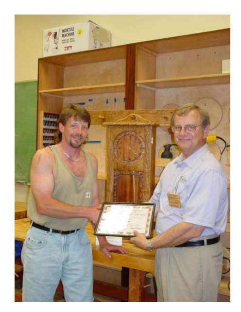
T. R. McNulty Clock