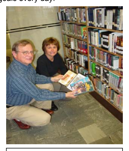
A sample of the 67 videotapes funded by SDFWA, which are available at the SD Public Library

over 7 million visitors each year and it is through generosity the likes of that of the SDFWA that helps the library fulfill its goals every day.